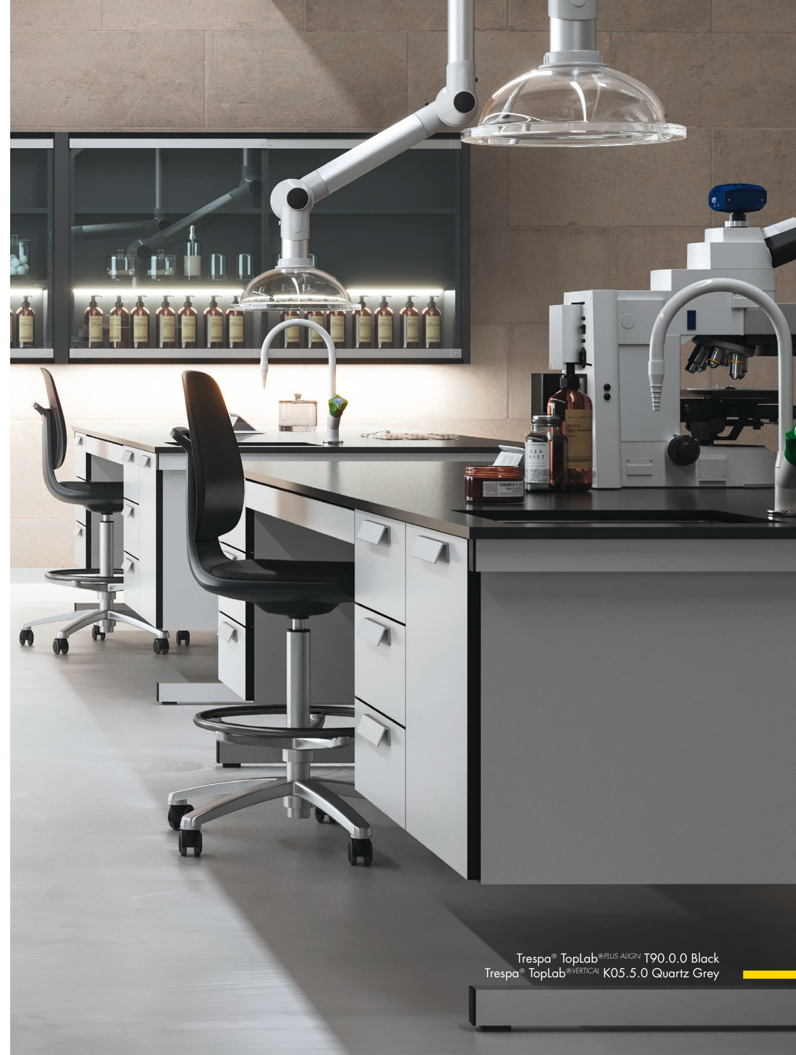
Trespa® TopLab® PLUS ALIGN T90.0.0 Black Trespa® TopLab® VERTICAL K05.5.0 Quartz Grey